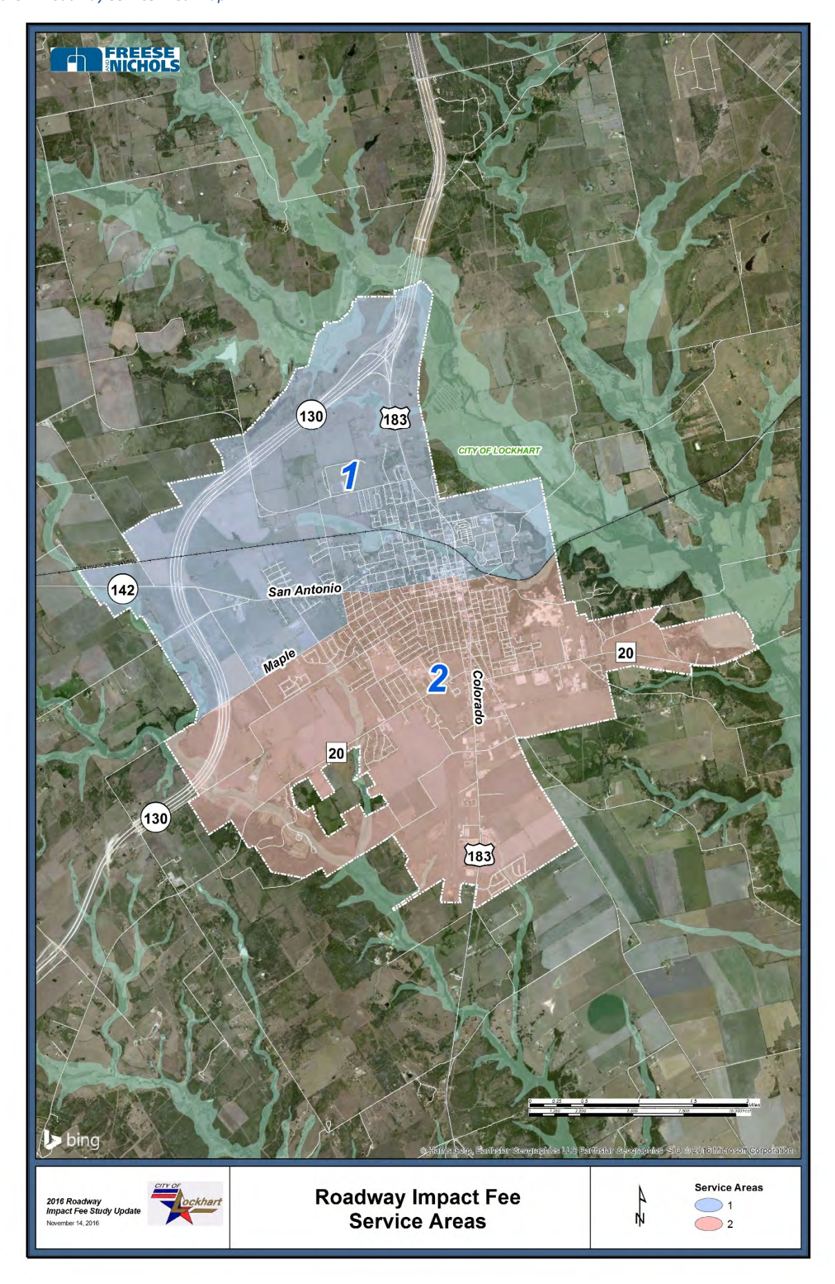
Page 3 | 2016 Land Use Assumptions